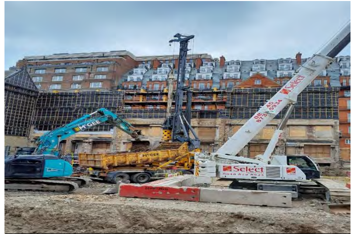
An updated view of the ongoing works on site.