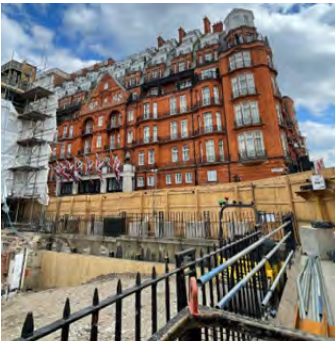
Brookfield House stone dismantling is now complete.