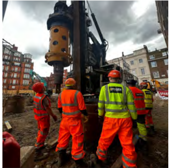
Plunge column installation for Phase 2 of piling.